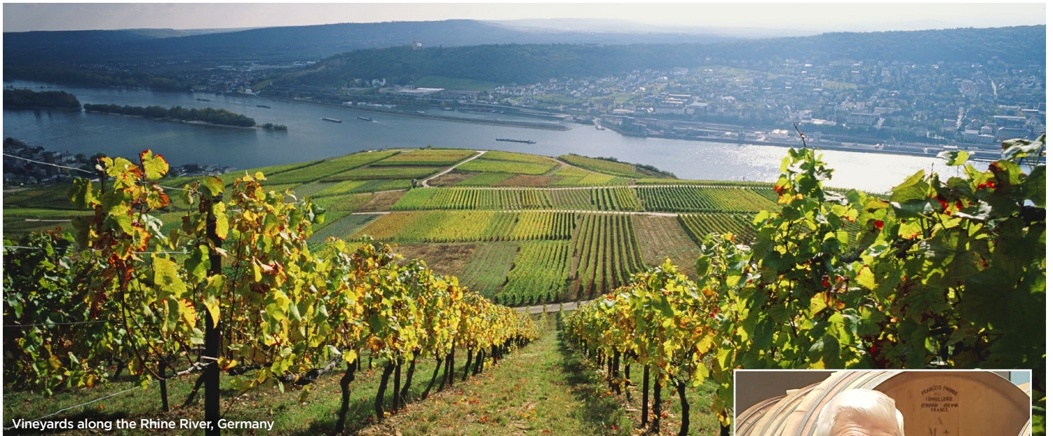
Vineyards along the Rhine River, Germany

Uncork local traditions, savor intense flavors and enjoy palate-pleasing adventures during an AmaWaterways Wine Cruise